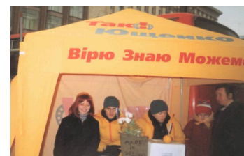
Orange tent filled with students & teachers

The tents self-governing system was amazingly efficient. Teachers were coordinating groups of students. Unarmed guards secured the perimeter; cooks provided the food; unoccupied students slept or cleaned the territory. Thanks to the efforts of medical students, special first-aid tents were set up in the tent city. The typical protest tent on Khreschatyk Street became the main symbol of our revolution, a revolution of smiles and joy, with non-stop concerts, frequent public