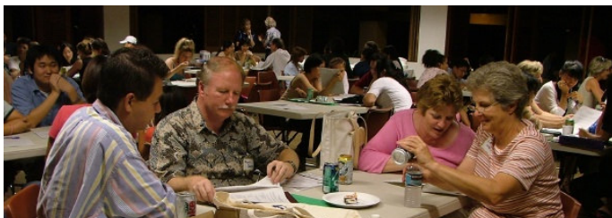
Teachers mingle at dinner