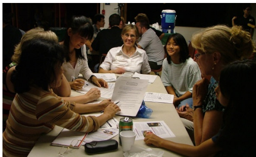
Taking a quiz on vocabulary