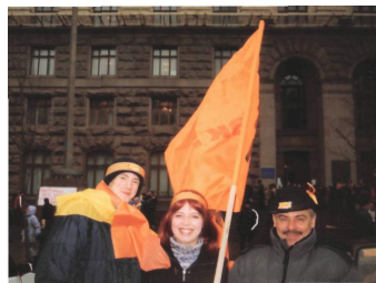
The symbolic orange flag