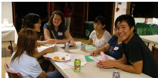
HITESOL student members chat