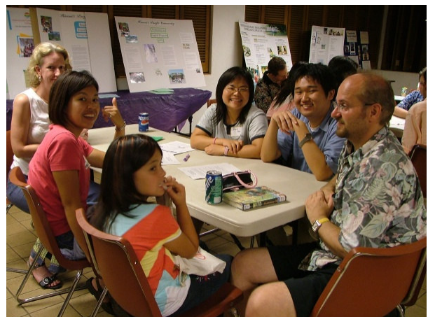
Students and teachers meet for discussion groups